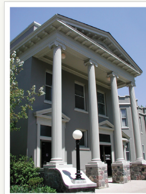
Head Office London ON

The Indaba division produces research for IT vendors, drawing on the extensive knowledge of end user requirements garnered from Info-Tech members.