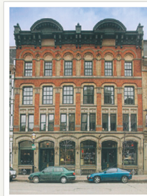
Satellite Office Toronto ON